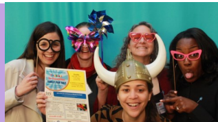
Staff from Exchange Family Center attended the Prevent Child Abuse North Carolina Summit