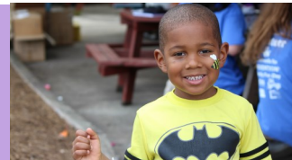
Community members enjoyed our 4th Annual Pinwheels for Prevention Family Fun Day at Wheels Fun Park